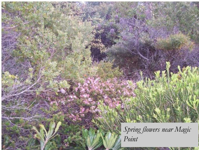
Spring flowers near Magic Point