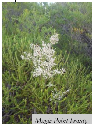
Magic Point beauty

NOTE! 85% of respondents to a Southern Courier poll were against residential development on the Headland