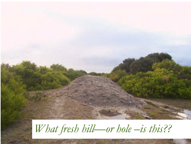
What fresh hill—or hole—is this??

Alan Hall reported that seedlings were still appearing after the fire at the back of Byrne Crescent. Particularly pleasing is the reappearance of Boronia ledifolia , B. rigidus , and Platysace ericoides in this area.