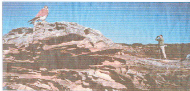
SMH THURS 29/8/02